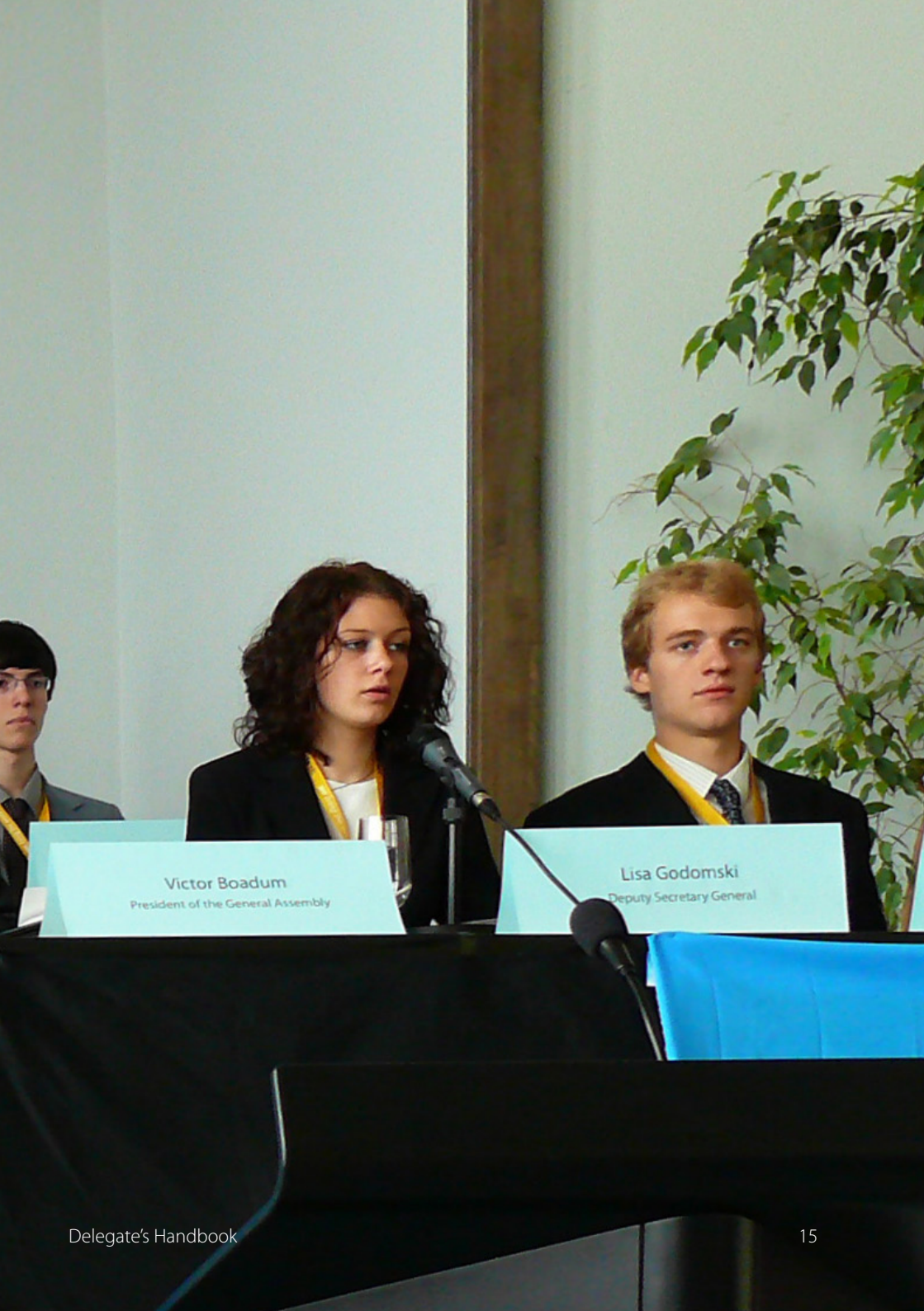
Victor Boadum President of the General Assembly